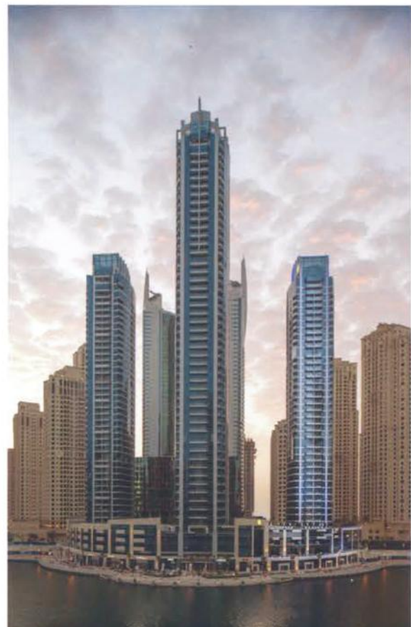
Opposite: Overall night view of the tower from the Dubai Marina Mall